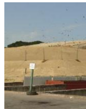
IRA - Açores