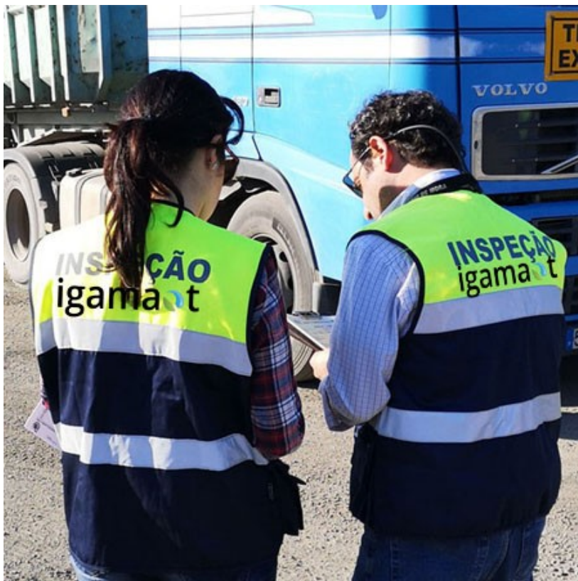
Conferência da Rede Nacional IMPEL, 16 de abril 2021, Coimbra